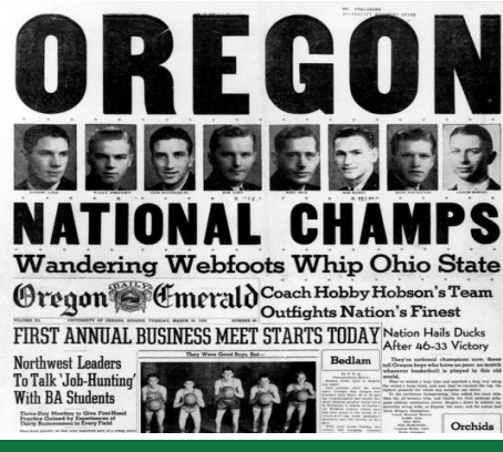
THE WEBFOOTS victory was front-page news in Oregon.

Huge crowds welcomed them in Portland and Eugene to climax one of the legendary events in the state's athletic history.