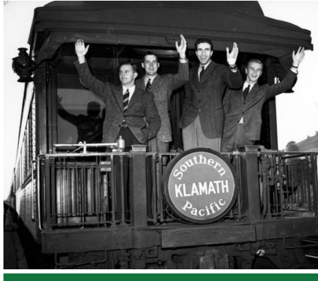
PLAYERS were welcomed by fans all along the valley as they traveled back to Eugene.