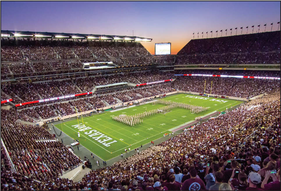
Texas A&M ranked No. 6 nationally in home attendance in 2023 with an average of 99,234 and has drawn more than a half-million fans to Kyle Field every season since 2006, with the exception of the pandemic-limited 2020 campaign.