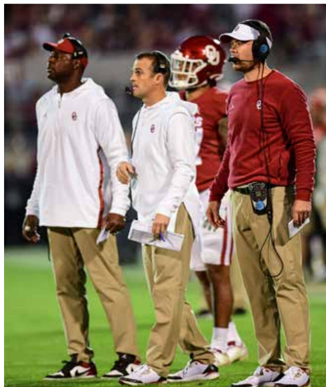
South Carolina head coach Shane Beamer was on Lincoln Riley's staff at Oklahoma from 2018-2020.

WHEN WILL I SEE YOU AGAIN?: These two squads will meet again in the 2026 season in Norman. Oklahoma's next trip to Columbia will come in 2028.