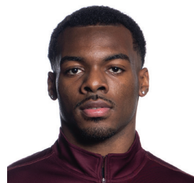
5 JACARI LANE