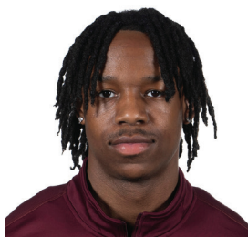
1 JOSH HOLLOWAY