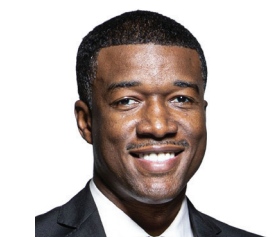
AC TJ CLEVELAND