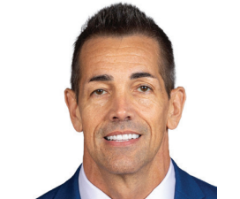
SC DARBY RICH