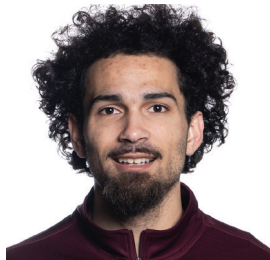
2 POP ISAACS