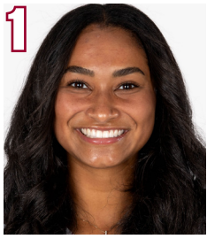
1 PRECIOUS BLOSS OF | 5-7 | So. | R/R Columbia, S.C.