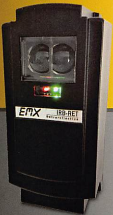
EG111 MONITORED PHOTO EYE INCLUDED