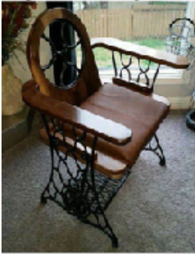
Amazing chair from an old Singer Treadle Sewing Machine!