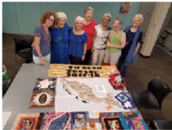
The Tucson Quilt Documentation Group poses with a quilt representing migrants who died crossing the border in the Tucson Sector.

Check out an Appliqued Solar System Quilt Used as a Teaching Aid in the Late 19th century