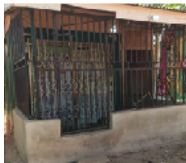
Rebecca's shop in Ghana