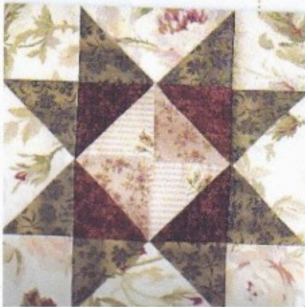
Autumn Star BOM for December

We are making this block in Red, green and White Christmas Print block for December.