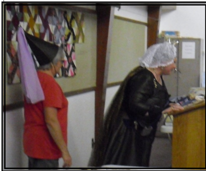
Queen Victoria and her lady in waiting, "Tea with the Queen", October

( if anyone has questions, please contact me ....610-252-0910 )