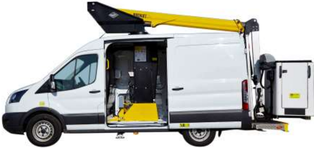
Vehicle Side look