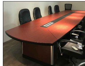
NAME: F1 CONFERENCE TABLE QUANTITY: 01

DIMENSION: 1400mm [WIDTH] 4800mm [LENGTH] 760mm [HEIGHT]