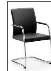
NAME: F3 MEDIUM BACK CHAIR (STAND) QUANTITY: 8