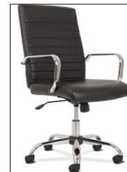
NAME: F2 MEDIUM BACK CHAIR (WITH WHEELS) QUANTITY: 17

CODE: COMT588-M @ ALLORA OFFICE FURNITURE