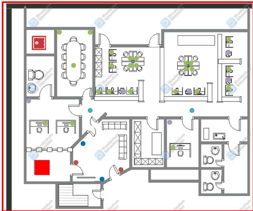
Office Floor Plan