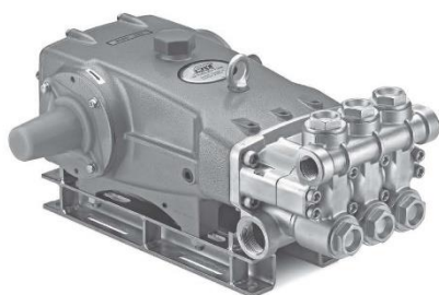
Model 3545 Shown (Shaft protector included, mounting rails sold separately)