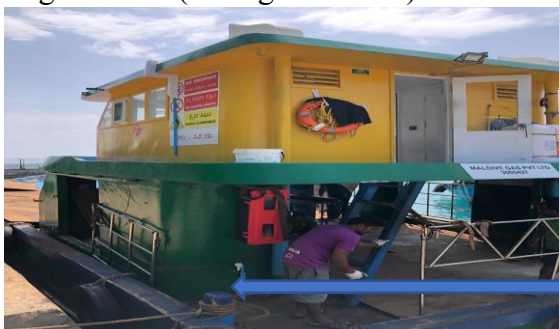
PIPE LINE (4" High Pressure)