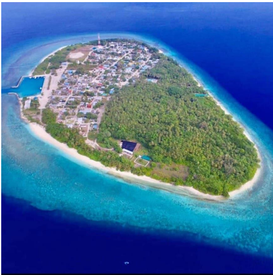
Football Ground: R. Rasgetheemu Site visit report – supporting information