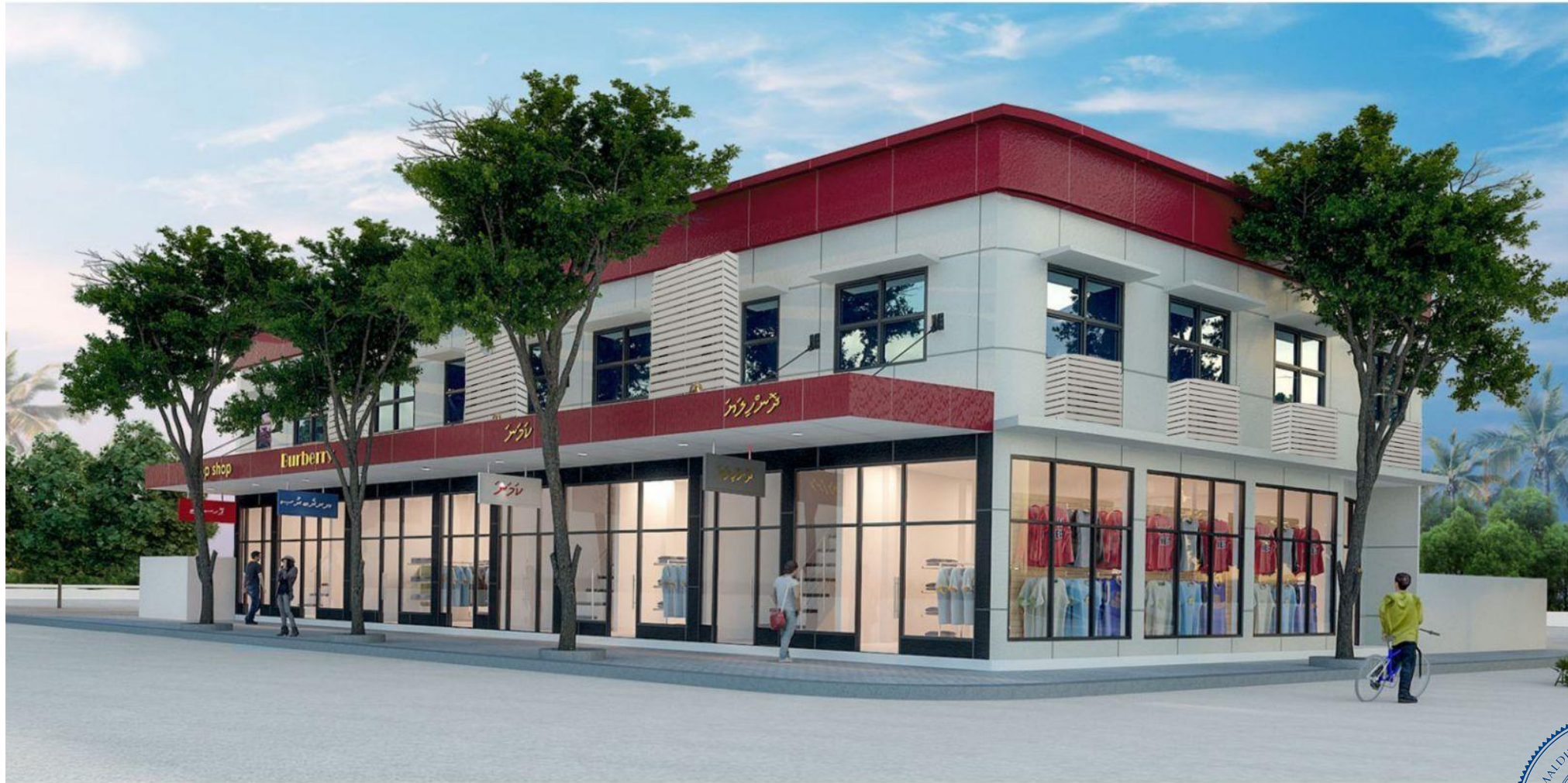
HITHADHOO CAMPUS SHOP BUILDING Maldives National University,