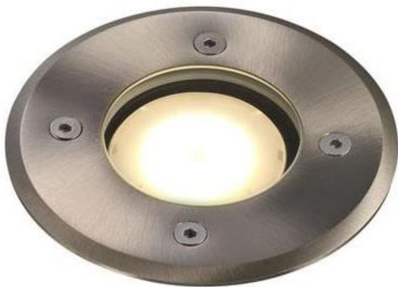
Outdoor ground light (Stainless Steel)

13. ވަރަށް ބޮޑު ފުލިމިޔަންޑް ހުންނަންޖެހެނެވެ. (ފުލިމިޔަންޑް ދިވެހިސަރުކާރުގެ)