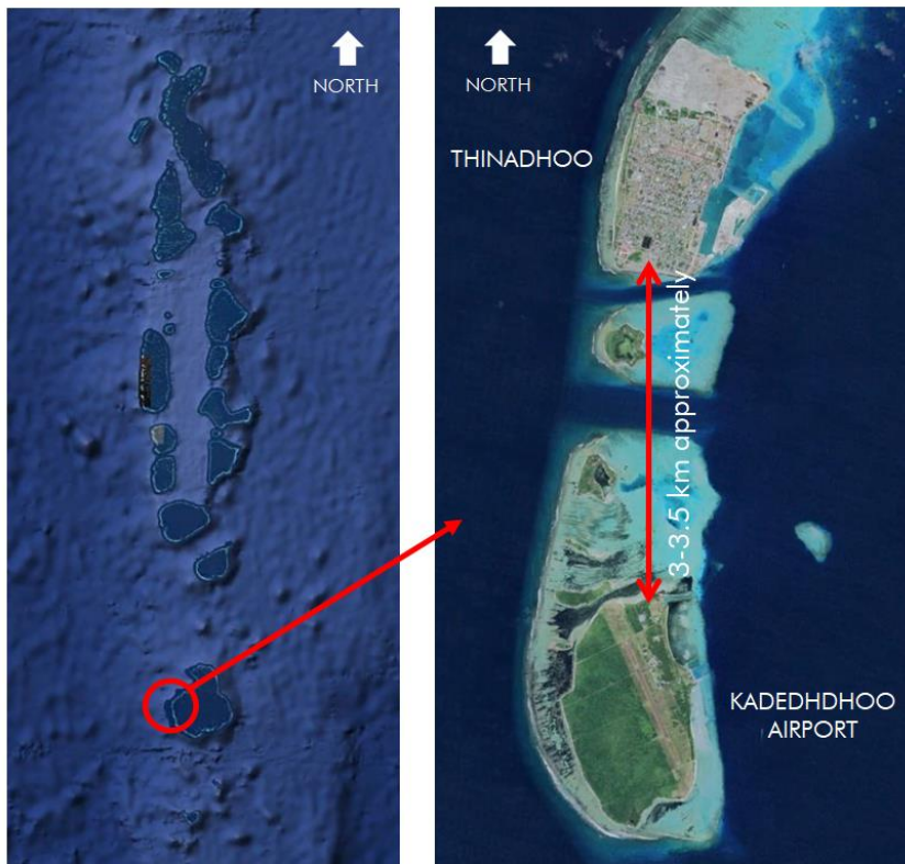
Map of Maldives

The project site encompasses harbours and navigation channels, in addition to an operational domestic airport. Within close proximity to the project site are operational resort islands, necessitating regular arrivals and departures of tourists to and from Kaadedhdhoo airport. Serving as the capital of Gaafu Dhaalu Atoll and the most densely populated island in Huvadhoo Atoll, the island of Thinadhoo holds a central position in the project's context. The geographical placement of the islands where the proposed link is envisaged can be visualized in Figure 3.