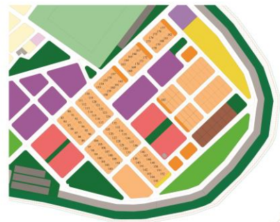
PROPOSED LOCATION FOR RESIDENTIAL PLOTS (AREA=1200SQFT OF 100 PLOTS)