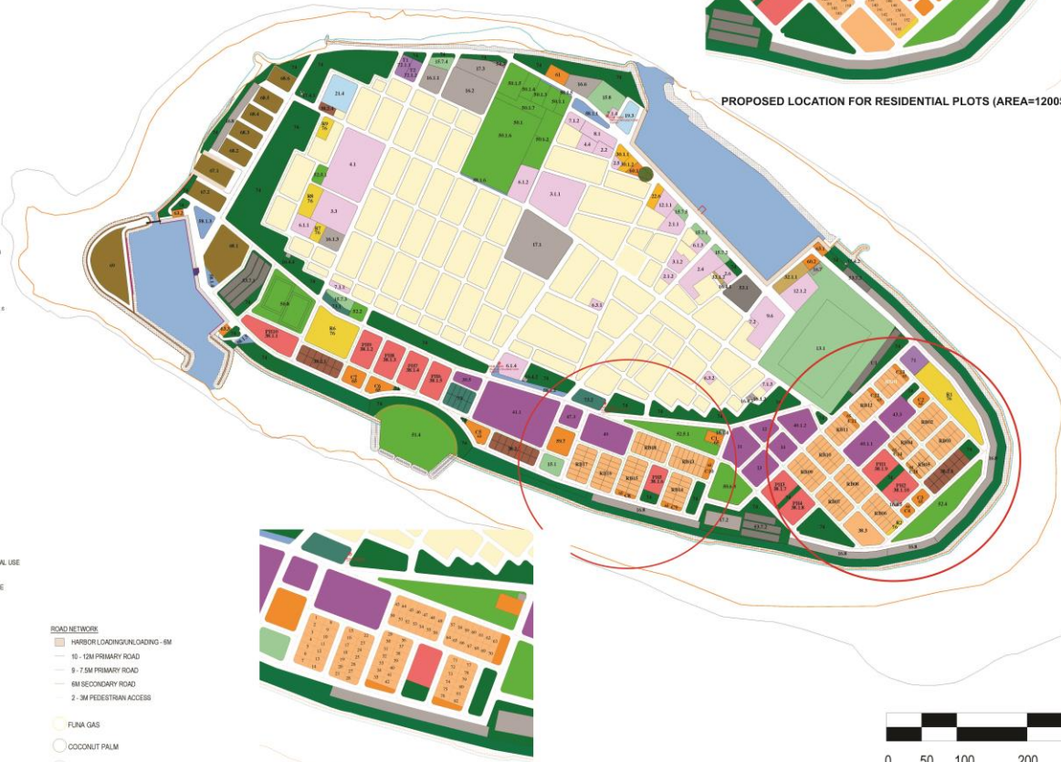
PROPOSED LOCATION FOR RESIDENTIAL PLOTS (AREA=1200SQFT OF 83 PLOTS)