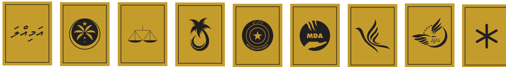
Party Boards 5.65cm x 7.5cm