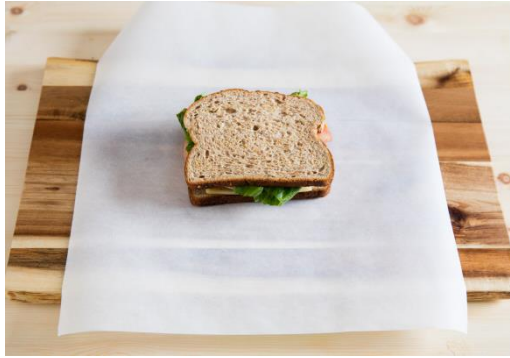
تُغْرَقُ السَّنْدْوِشَاتُ فِي خَدَائِشٍ مِثْلِ هَذِهِ

✓ تَجْرِبَةُ تَرْبِيعِ السَّنْدْوِشِ فِي خَدَائِشٍ مِثْلِ هَذِهِ تَسَبِّبُ تَلَفًا لِيَتَلَبَّسَ بِهَا الْغَدَاةُ الْبَاقِيَةٌ فِيهَا.