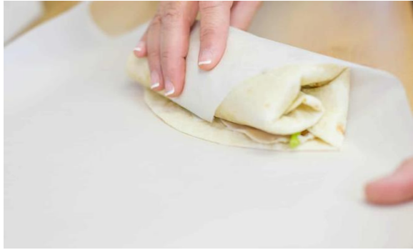
تُغْرَقُ السَّنْدْوِشَاتُ فِي خَدَائِشٍ مِثْلِ هَذِهِ

✓ تَجْرِبَةُ تَرْبِيعِ السَّنْدْوِشِ فِي خَدَائِشٍ مِثْلِ هَذِهِ تَسَبِّبُ تَلَفًا لِيَتَلَبَّسَ بِهَا الْغَدَاةُ الْبَاقِيَةٌ فِيهَا.