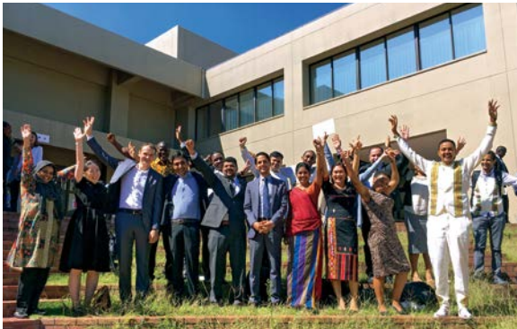
A previous PEPP cohort celebrate arriving on campus following their matriculation ceremony