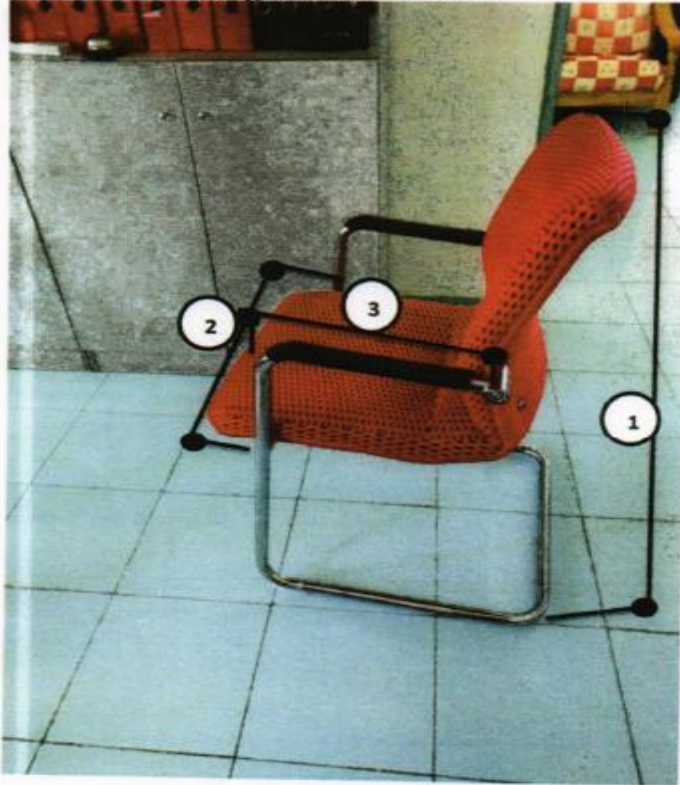
Stage Chair with Arm