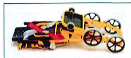
MODEL #8020 Folded

Highly versatile, folding design allows the 8020 to be used for aviation and emergency/rescue applications. Offers mid wheel turning design, brake, lifting handles, and ABS plastic seat and back to meet FAR fire requirements and folding design for compact transportation and storage.