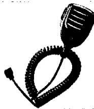
HM-161 HAND MICROPHONE Same as supplied.