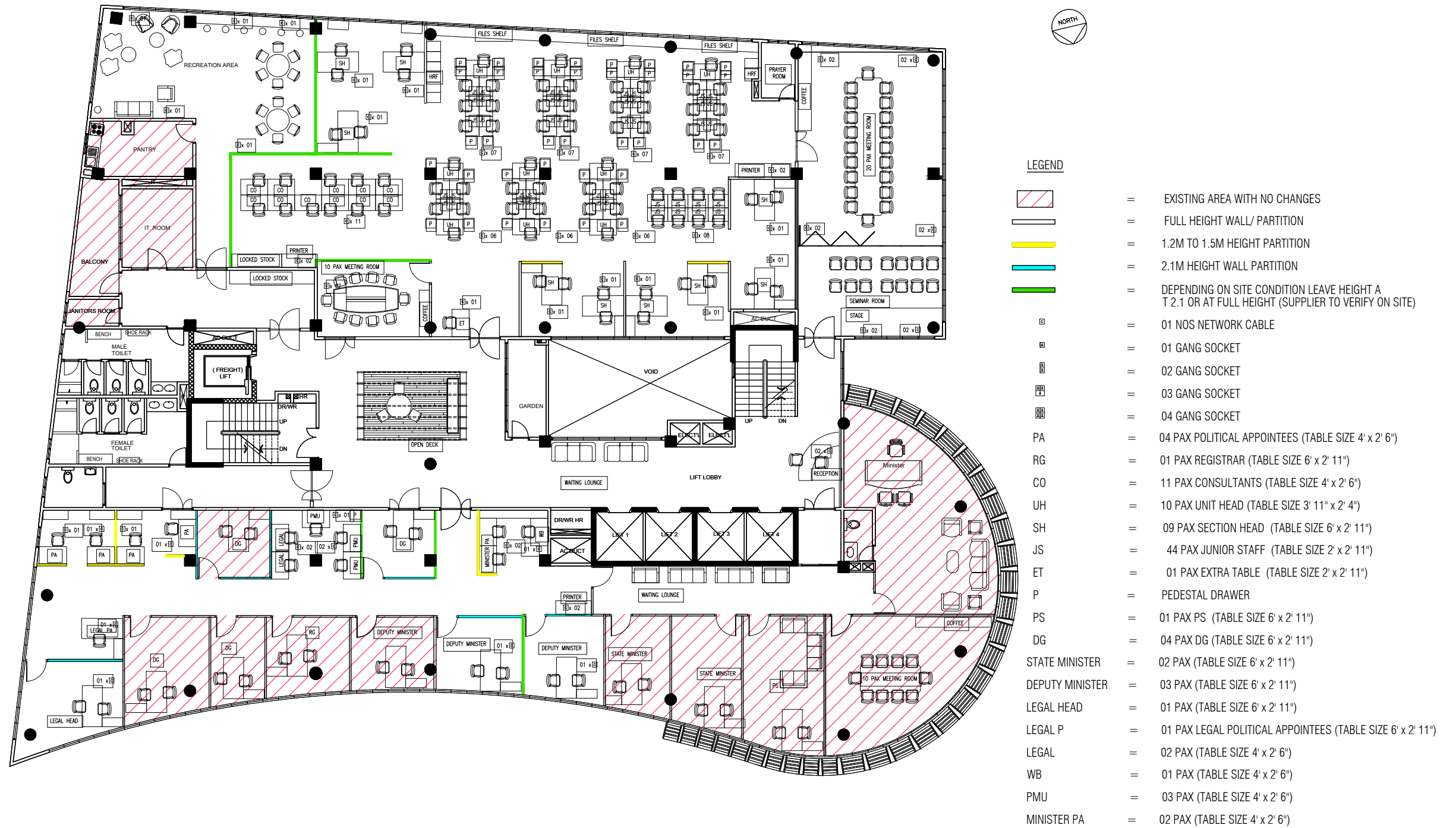
11TH FLOOR PROPOSED NETWORK SOCKETS LAYOUT PLAN SCALE 1:200