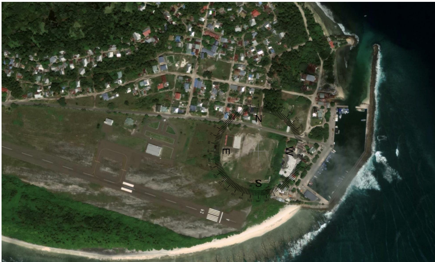
Football Ground: Fuvahmulaku (Dhoodigam) Site visit report – supporting information