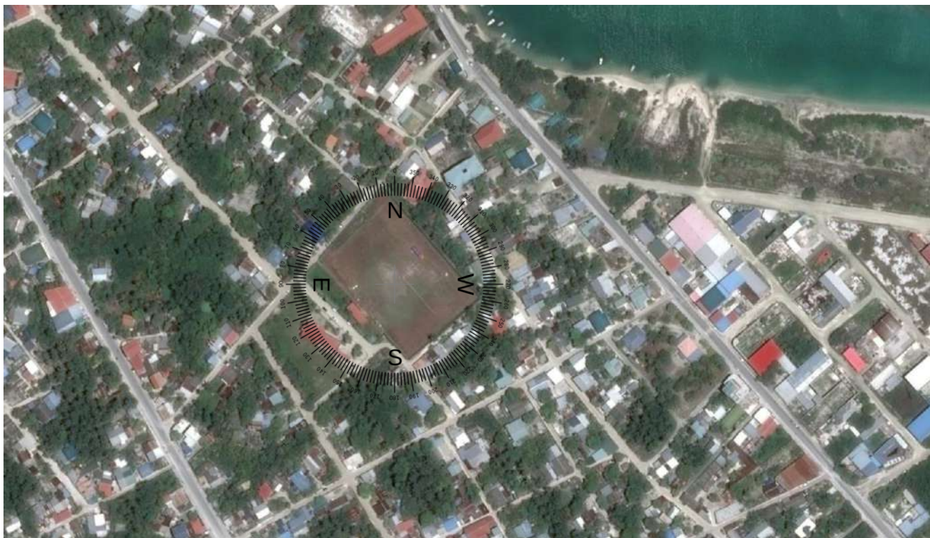
Football Ground: S. Hithadhoo Site visit report – supporting information