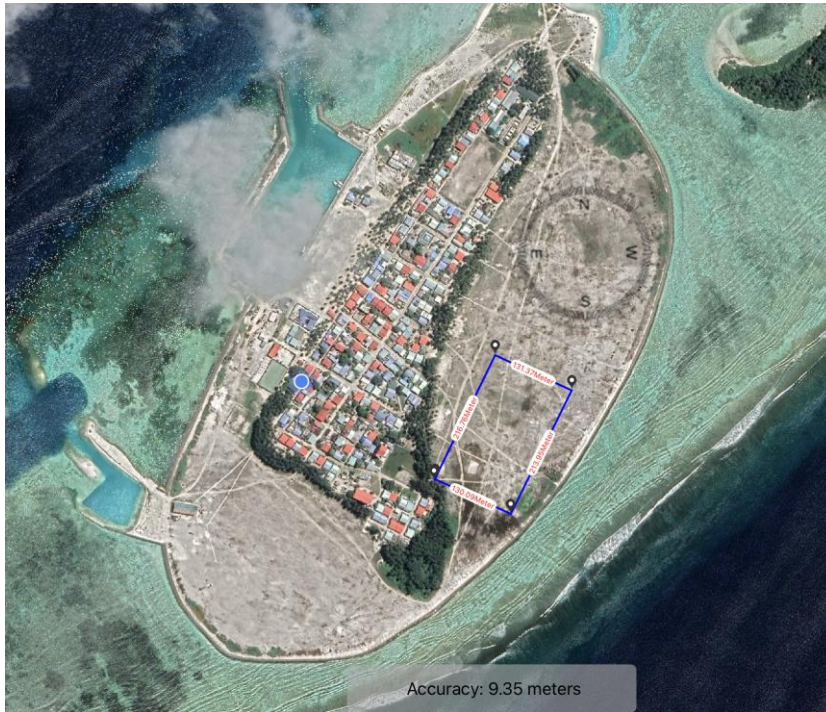
Football Ground Thaa. Madifushi Site visit report – supporting information