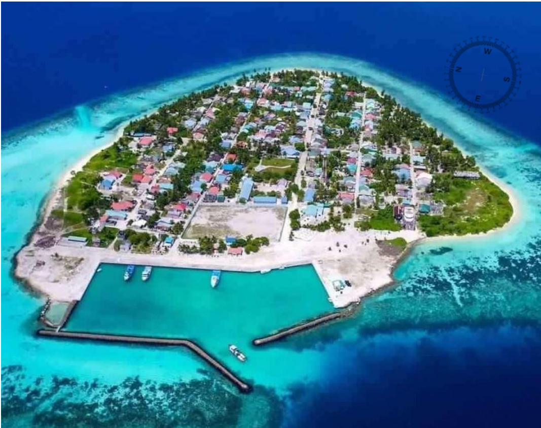
Football Ground GA. Dheevadhoo Site visit report – supporting information.