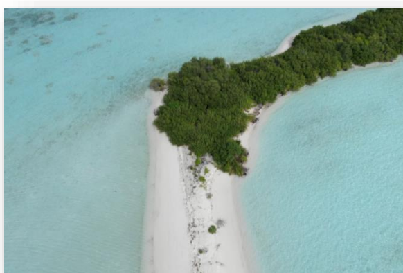
Seedheehuraa ( 2^{\circ}51'28''\text{N } 73^{\circ}33'28''\text{E} )