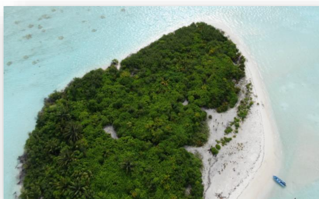
Seedheehuraa Veligan' du ( 2^{\circ}51'34''\text{N } 73^{\circ}33'15''\text{E} )