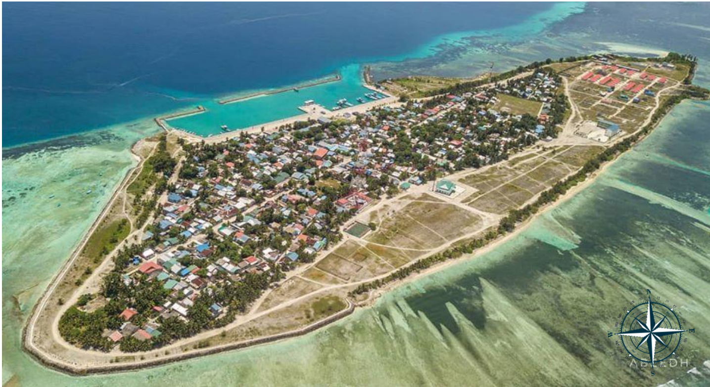
Football Ground GDh. Gahdhoo Site visit report – supporting information.