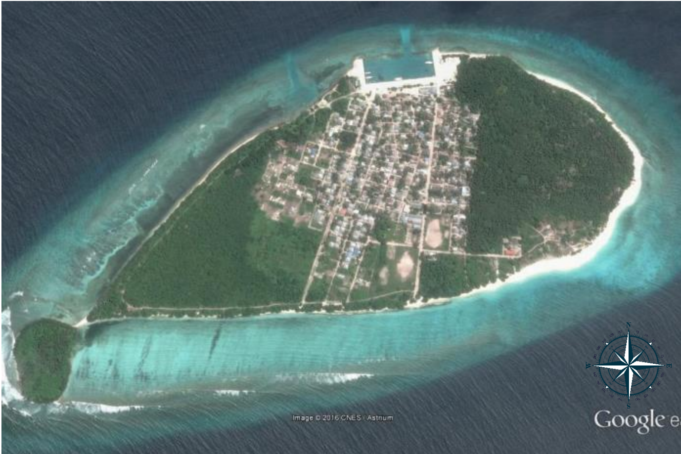
Football Ground Sh. Kanditheemu Site visit report – supporting information.