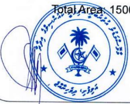
Proposed Land for TVET Center, R.Alifushi