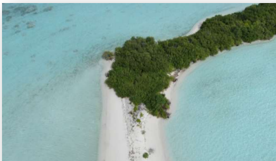
Seedheehuraa ( 2^{\circ}51'28''\text{N } 73^{\circ}33'28''\text{E} )