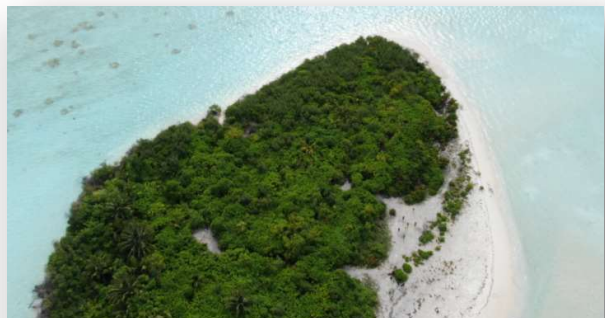
Seedheehuraa Veligan'du ( 2^{\circ}51'34''\text{N } 73^{\circ}33'15''\text{E} )