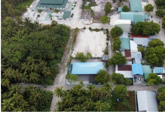
3- ސަރުކާރުގެ ސަރަޙައްދު 100ft