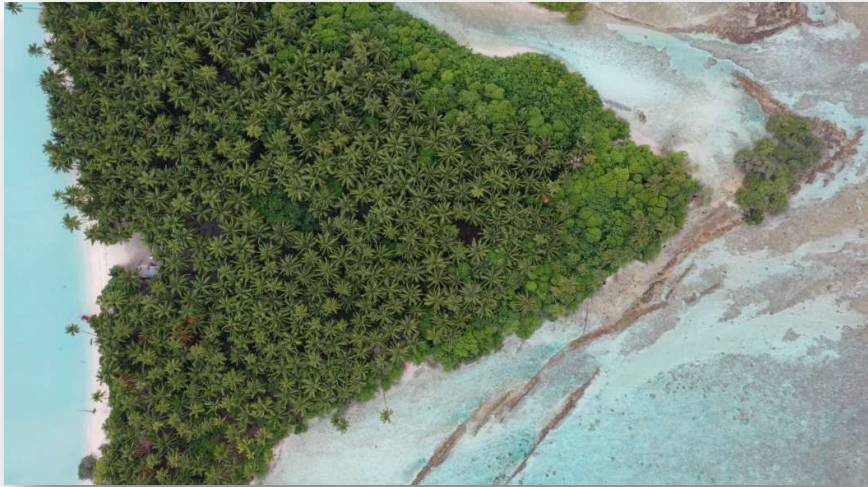
11. Olhufushi in Thaa Atoll ( 2^{\circ}21'57''\text{N} 72^{\circ}54'31''\text{E} ) with Olhufushifinolhu ( 2^{\circ}22'17''\text{N} 72^{\circ}54'30''\text{E} )