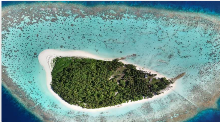
18. Ferethaviligilla ( 0^{\circ}22'19''\text{N} 73^{\circ}1'26''\text{E} ), Dhekaanbaa ( 0^{\circ}22'25''\text{N} 73^{\circ}1'21''\text{E} ), Koderataa ( 0^{\circ}22'4''\text{N} 73^{\circ}1'31''\text{E} ), Islands with Coordinates ( 0^{\circ}22'12.86''\text{N} 73^{\circ}1'28.98''\text{E} ) in Gaaf Dhaal Atoll.