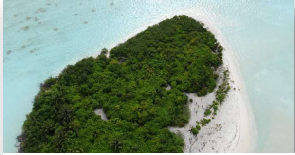
Seedheehuraa Veligan'du (2°51'34"N 73°33'15"E)