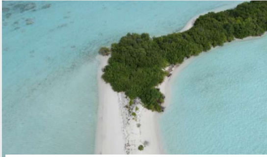
Seedheehuraa (2°51'28"N 73°33'28"E)