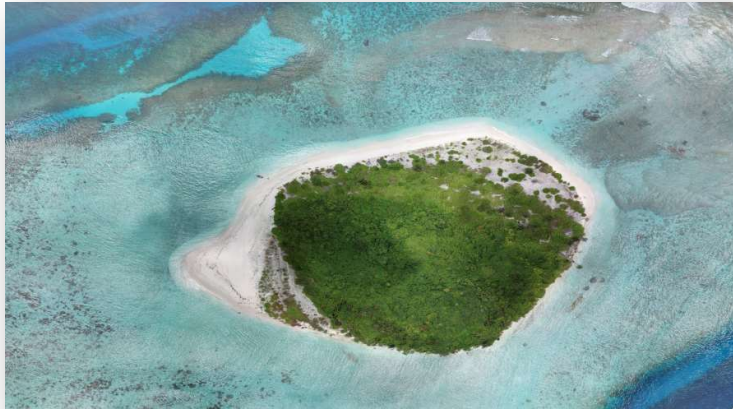
17. Kan'dahalagalaa in Gaaf Dhall Atoll ( 0^{\circ}13'30''\text{N} 73^{\circ}13'0''\text{E} )