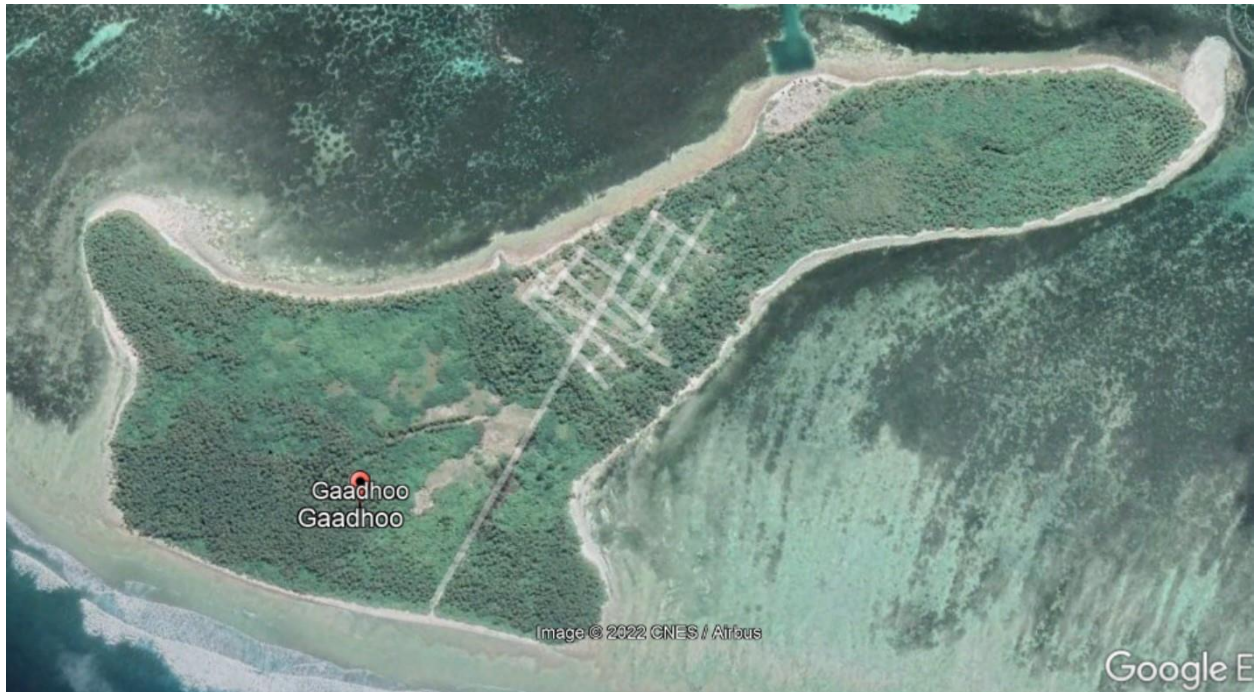
L.Gaadhoo, Project site