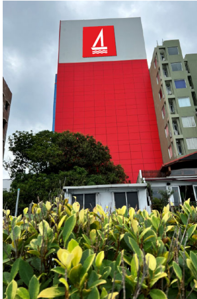
Sample illustration of BML LOGO