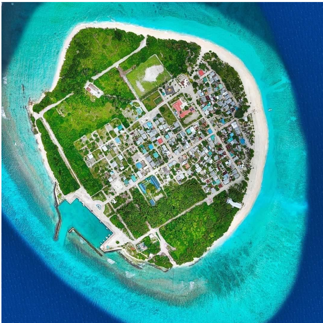
Drawing of the pitch area