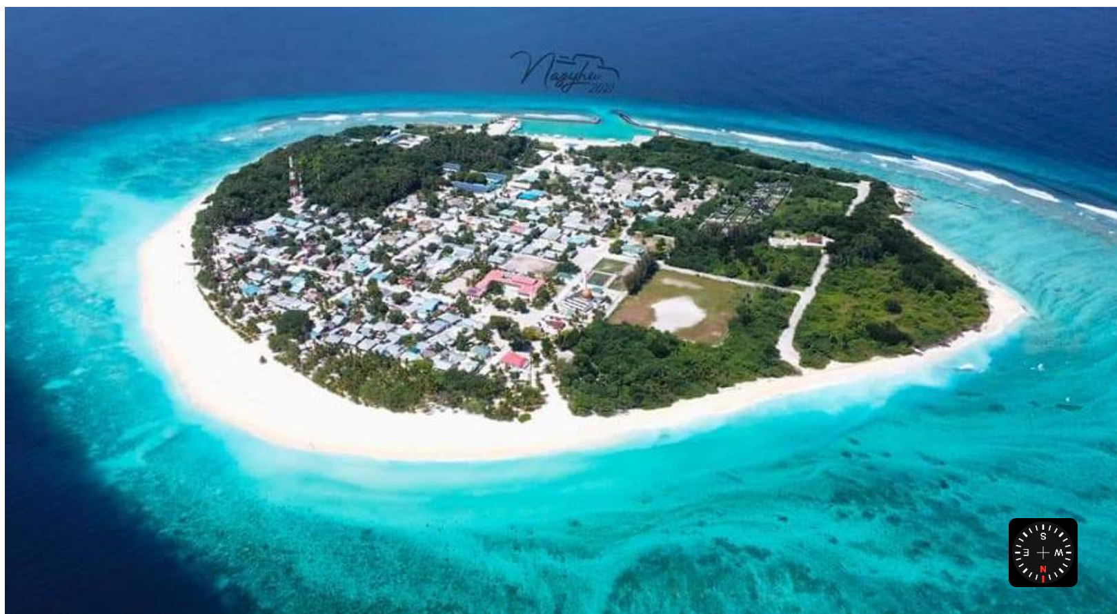
Football Ground: HA. Utheemu Site visit report – supporting information