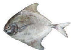
Black Pomfret Whole #991003 - (600-800GR/PC) 10KG