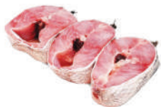
Snake Head Fish Chunks