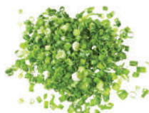
Green Onion Slices