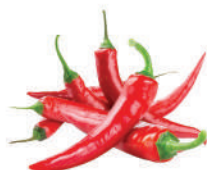
Red Chilli Pepper