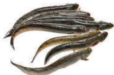
Mudskipper 10% Glazing