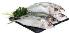
Indian Mackerel Whole #991011 - 800GR X 12 (6-8PCS/BAG)