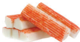
Surimi Crab Stick