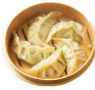
Seafood Gyoza #992014 - (25GR X 20) X 20