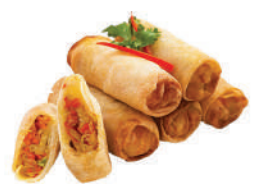
Vegetable Spring Roll #992021 - (15GR X 60) X 10