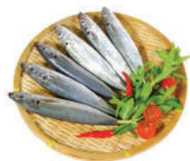
Shortfin Scad Whole Cleaned