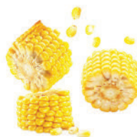
Sweet Corn in PCS 5CM