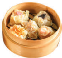
Mixed Dimsum (Steam)