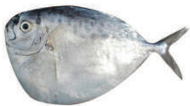
Moonfish Whole Cleaned