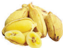
Steamed Saba Banana