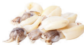
Baby Cuttlefish Whole