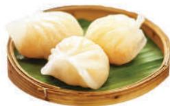
Royal Shrimp Haukau