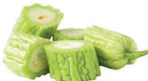
Bitter Melon in PCS