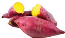
Japanese Sweet Potatoes