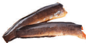
Yellow Catfish Whole Clean