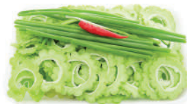
Bitter Melon Slices