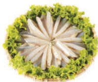
Anchovy Headless #991002 - 250GR X 40