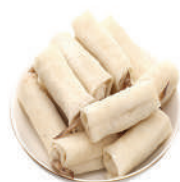
Mini Shrimp Spring Roll