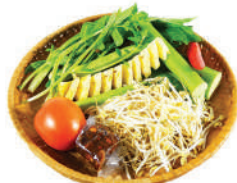
Tamarind Soup and Vegetables