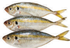
Yellow Stripe Trevally