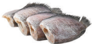
Snake Skin Gourami Fish