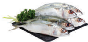
Indian Mackerel Steamed #991010 - 400GR X 25