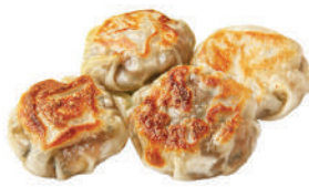
Panfry Shrimp & Leek Dumpling #992017 - (25GR X 15) X 28