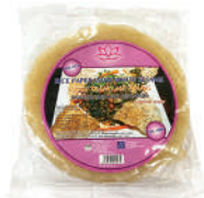
Rice Paper With White Sesame