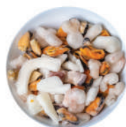
Cocktail Seafood Mix