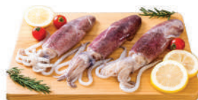
Whole Squid Cleaned