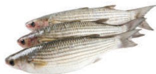
Grey Mullet Whole #991009 - 400GR X 25