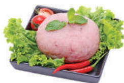
Featherback Fish Paste #991007 - 400GR X 25