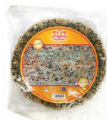
Rice Paper With White Sesame And Shrimp 22CM