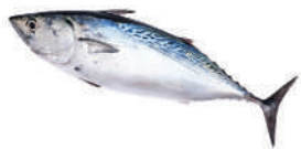
Bonito Tuna #991001 - 10KG