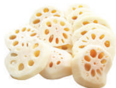
Lotus Root Slices 4-7CM