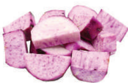
Yam in PCS