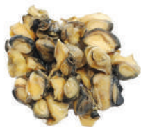
Apple Snail Meat