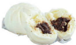
Red Bean Bun