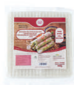
Fresh Spring Roll