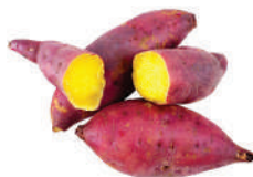
Boiled Sweet Potatoes