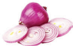
Red Onion Slices