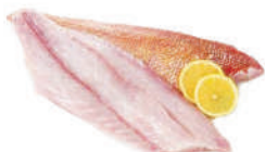
Red Snapper Fillet