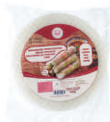
Fresh Spring Roll