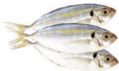
Yellowtail Scad Whole Cleaned