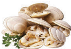
White Clam Whole Cooked