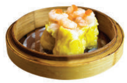
Shrimp Siu Mai #992018 - (25GR X 20) X 20