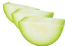
Winter Melon Cut