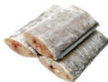
Largehead Hairtail chunk #991012 - 800GR X 12