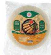
Spring Roll Wrapper Rice Paper (Round) 22CM