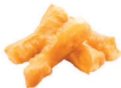
Fried Bread Stick