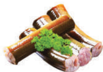
Swamp Eel Chunks