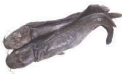
Catfish Whole #991005 - 10KG (300-500GR/PC)