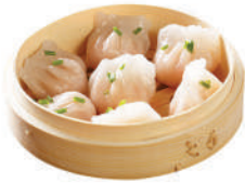
Shrimp & Chives Haukau #992016 - (25GR X 20) X 20