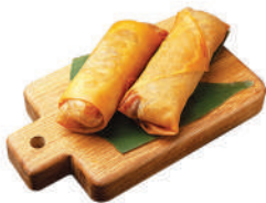
Spring Roll With Shrimp & Crab #992019 - (25GR X 20) X 20