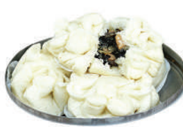
Vegetable Mushroom Bun #992020 - (30GR X 10) X 12