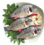
Climbing Perch Whole Cleaned #991006 - 400GR X 25 (4PCS/BAG)