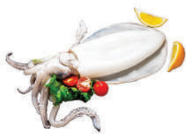
Cuttlefish Whole Cleaned