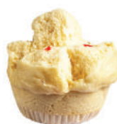
Money Bag Cake