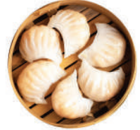
Seafood Haukau #992015 - (25GR X 20) X 20