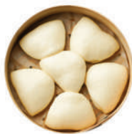
Flour Steam Bun - Gua Bao