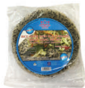
Rice Paper With Black Sesame