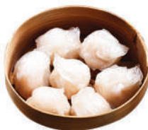
Royal Shrimp Haukau