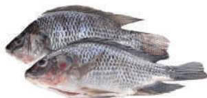
Tilapia Whole Cleaned