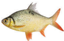
Red Tailed Tinfoil Whole