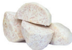
Taro Half Cut Frozen