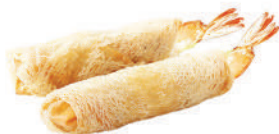
Net Shrimp Spring Roll PTO