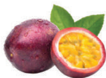
Passion Fruit Pulp