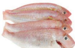
Golden Threadfin Bream Whole Clean #991008 - 1KG X 10 (4PCS/BAG)