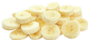
Boiled Banana Slice Frozen