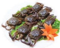
Oceanic Paddler Crab Whole