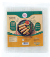
Spring Roll Wrapper