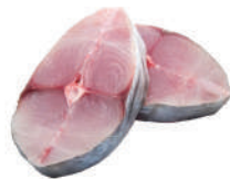
Spanish Mackerel Steak