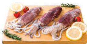
Whole Squid Cleaned