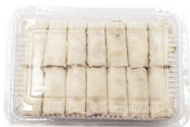
Jumbo Chicken Spring Roll