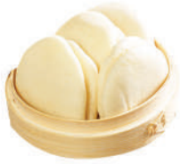
Sandwich Bun - Gua Bao #992013 - (45GR X 20) X 10