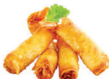
Shrimp Spring Roll 21/25