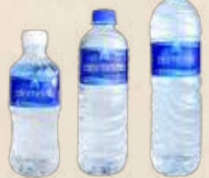
300ML | 500ML | 1.5L