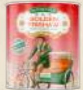
Premium Evaporated Creamer-Deluxe Gold