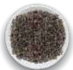
GUN POWDER 1 (GP1)