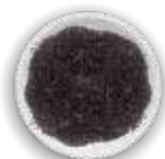
FLOWERY BROKEN ORANGE PEKOE FANNING (FBOPF)