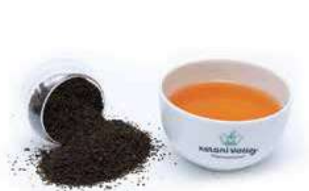
BOP Nuwara Eliya