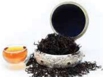
Nuwara Eliya Rare Tea