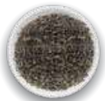
GUN POWDER SPECIAL (GP-SP)