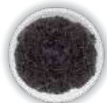
FLOWERY BROKEN ORANGE PEKOE FANNING EXTRA SPECIAL (FBOPFEXSP)