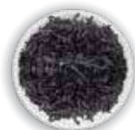
ORANGE PEKOE 'A' (OPA)