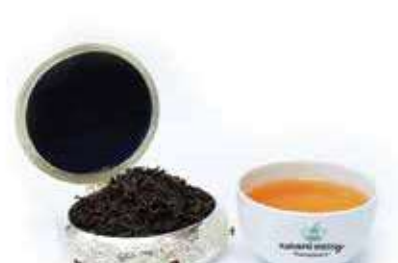
OP Nuwara Eliya