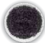
ORANGE PEKOE (OP)