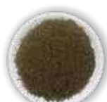
GREEN TEA FANNINGS (GT FNGS)