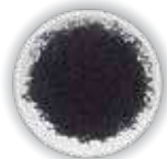
BROKEN ORANGE PEKOE (BOP)