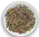
GREEN CURL (GC)