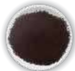
BROKEN ORANGE PEKOE FANNING (BOPF)