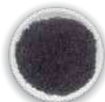
FLOWERY BROKEN ORANGE PEKOE (FBOP)