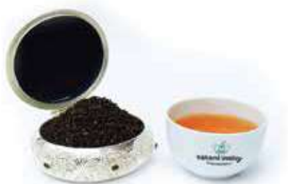
FBOPF SP Nuwara Eliya