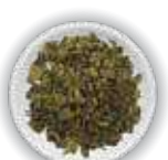
GREEN TEA OPA