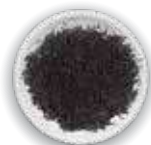
BROKEN ORANGE PEKOE 1 (BOP1)