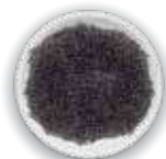
FLOWERY BROKEN ORANGE PEKOE 1 (FBOP1)