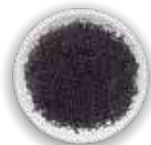
ORANGE PEKOE 1 (OP1)