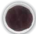
DUST 1 (D1)