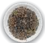
YOUNG HYSON (YH)