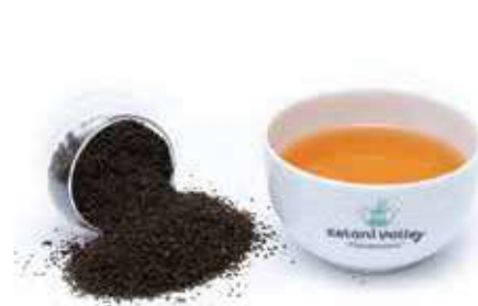
BOPF Nuwara Eliya