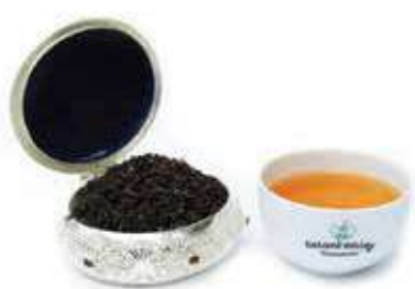
PEK Nuwara Eliya