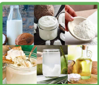
OTHER COCONUT PRODUCTS

PACKAGING Double Seale LDPE Poly Bags, 04Ply Kraft Paper Sack or Upon Request