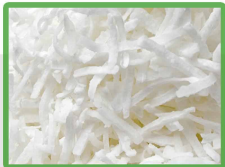
COCONUT FLAKES & THREADS

White Coconut Meat is Further Processed & widely used in Confectionery & Bakery Industries