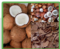
POONAC & COPRA

Another form of fancy Cuts & available in Toasted & Sweetened Forms.