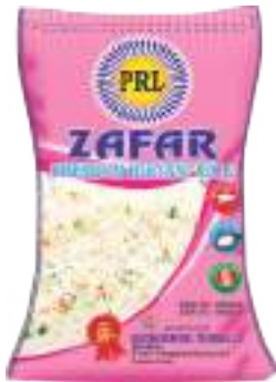
PRL Zafar Size Available (kg): 35 Packing Material: Non Woven Quality: PR 11 Steam Origin: India