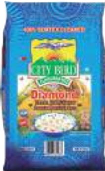
City Bird Diamond Size Available (kg): 35/18 Packing Material: Non Woven Quality: Biryani Rice Origin: India