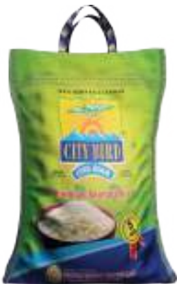
City Bird Normal Size Available (kg): 35/20/10/5 Packing Material: Cotton Quality: Pakistan 386 Origin: Pakistan