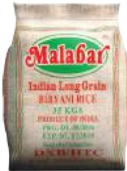
Malabar Size Available (kg): 35/40 lbs Packing Material: BOPP Quality: Biryani Rice Origin: India