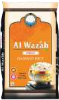
Al Wazah Size Available (kg): 40/5 Packing Material: Non Woven Quality: Golden sella basmati rice Origin: India