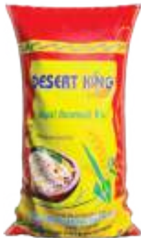
Desert King Size Available (kg): 35 Packing Material: Cotton Quality: Steam Basmati Rice Origin: Pakistan