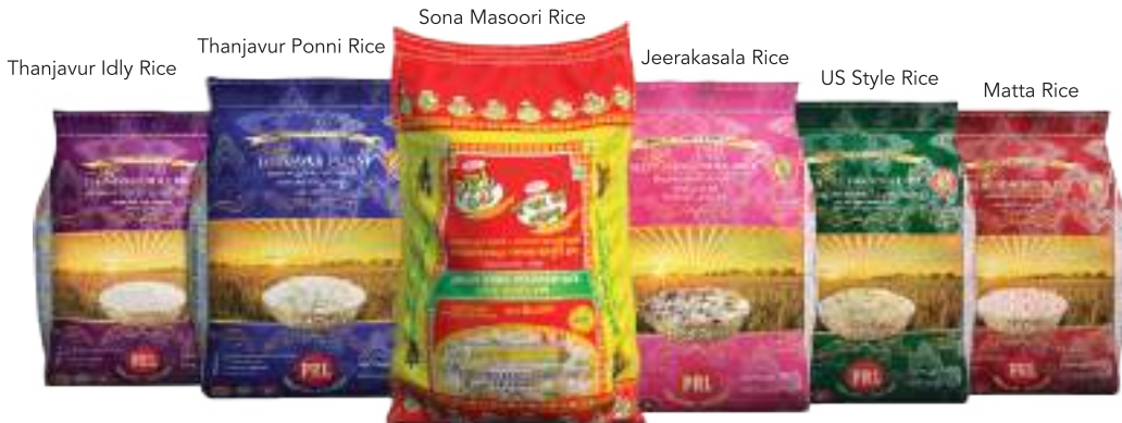
South Indian Range Size Available (kg): 18/9/4.5 Packing Material: BOPP Quality: South Indian Varieties Origin: India