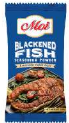
BLACKENED FISH SEASONING POWDER 120g | 500g | 1kg