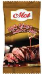
BBQ GLAZE SAUCE MIX