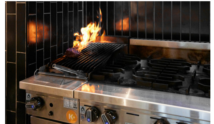
Naga Moon, Melbourne