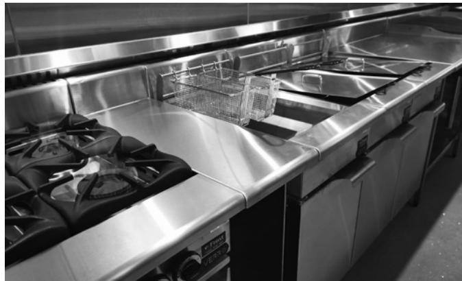
Swansea Workers Club, NSW