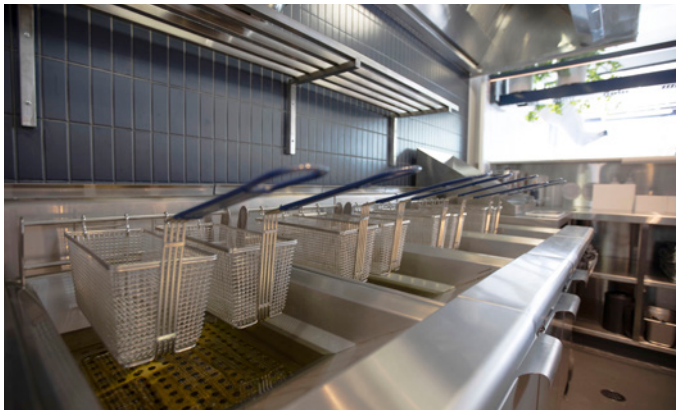
Pony Boy, Melbourne