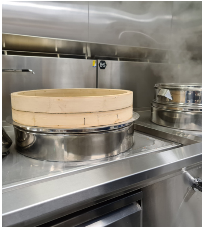
Bangaroo Crown, Sydney