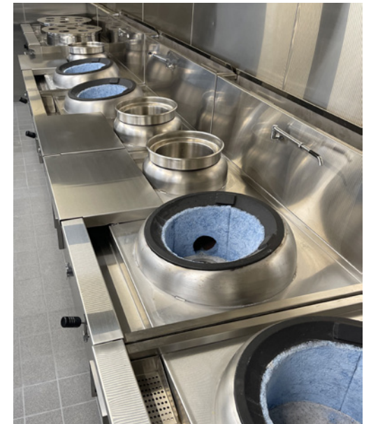
The Langham, Gold Coast