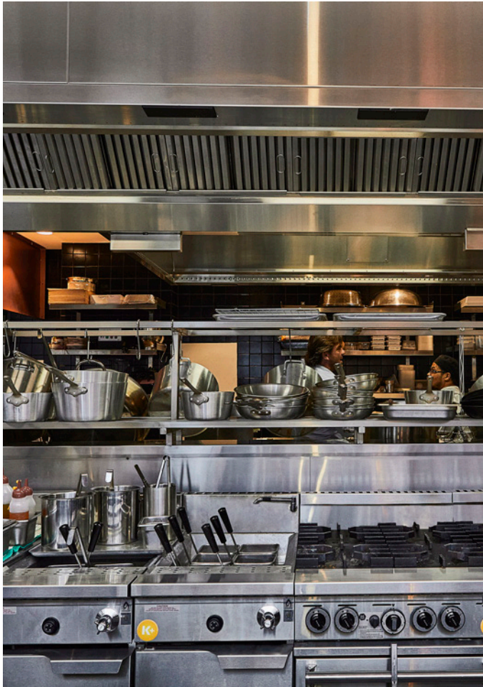
IGA Romeos, Sydney