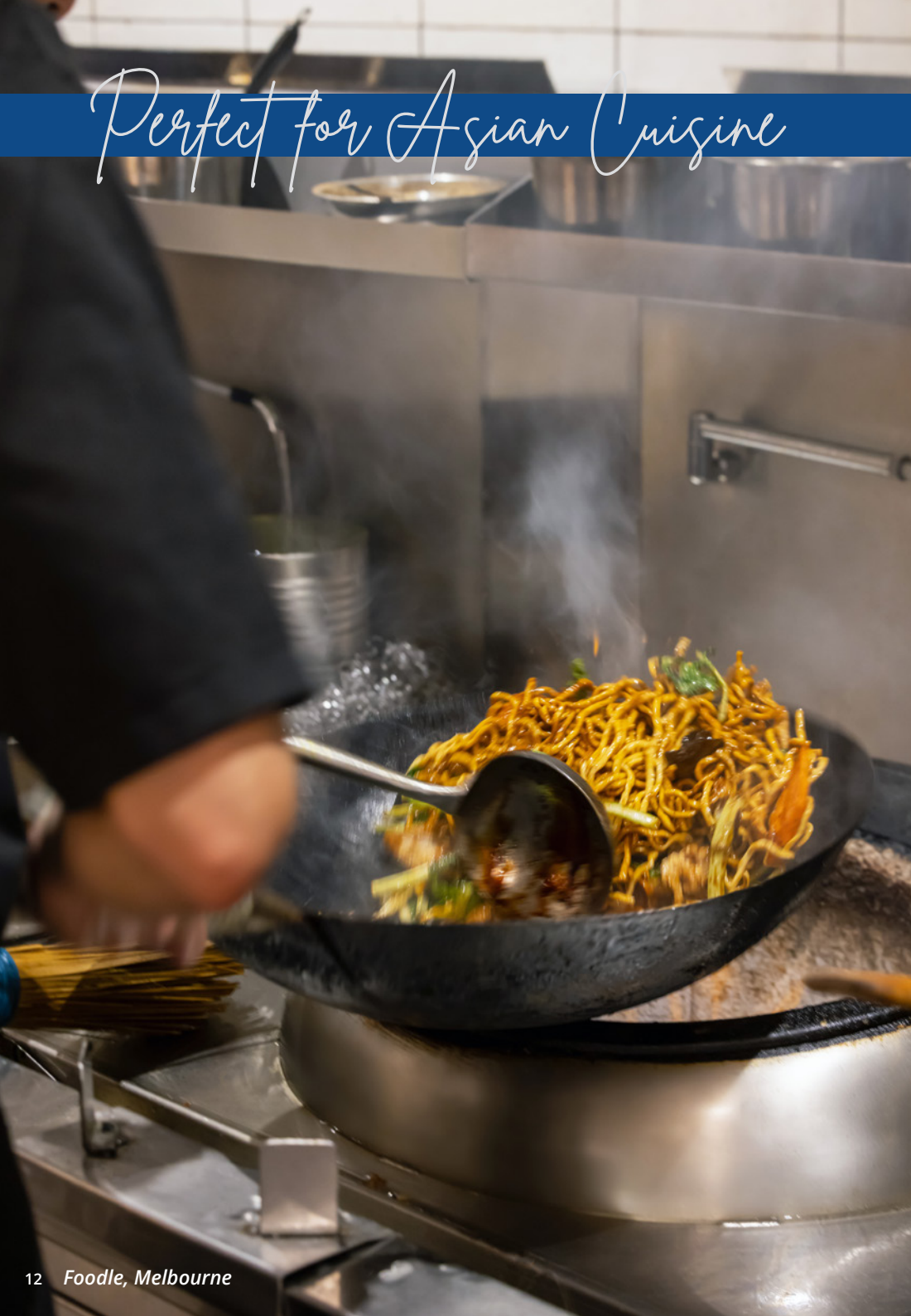
Uncle Su, The Star, Gold Coast