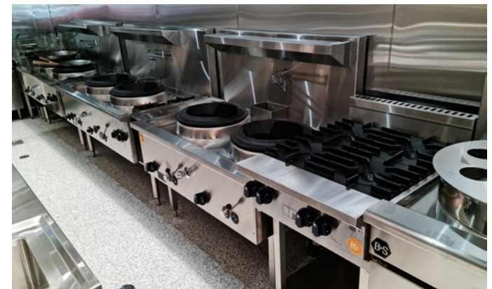
Dumpling House, Canberra