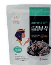
CLEOPATRA SALT Glutinous rice seaweed chips 35g