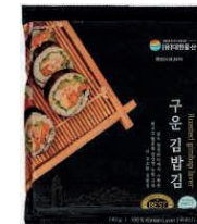
WANDO LOCAL FOOD PRODUCTS Kimbap seaweed 100 sheets