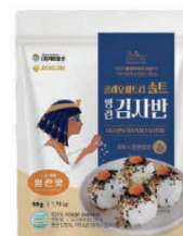
CLEOPATRA SALT Pollack roe seaweed meal 50g