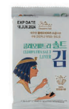
CLEOPATRA SALT Lunch box seaweed 3 packs