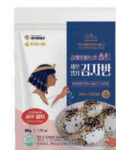
CLEOPATRA SALT Shrimp and anchovy seasoned seaweed 50g