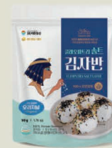
CLEOPATRA SALT Original seasoned seaweed 50g

Cleopatra Salt Products is made with seaweed from clean Wando seasoned only with Cleopatra salt, so it contains no artificial sweeteners, giving us healthy and rich flavors.