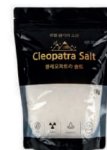
CLEOPATRA SALT Coarse salt 1kg