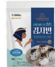
CLEOPATRA SALT Original seasoned seaweed 50g