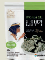
CLEOPATRA SALT Glutinous rice kelp chips 30g