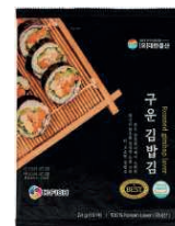
WANDO LOCAL FOOD PRODUCTS Kimbap seaweed 10 sheets