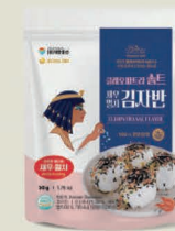
CLEOPATRA SALT Shrimp and anchovy seasoned seaweed 50g