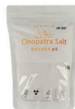
CLEOPATRA SALT Fine salt 1kg