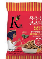
CLEOPATRA SALT Corn snack Buldak 50g