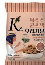
CLEOPATRA SALT Corn snack Original 50g