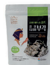
CLEOPATRA SALT Glutinous rice kelp chips 30g