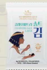
CLEOPATRA SALT Lunch box seaweed

Combination of clean Wando seaweed and Cleopatra salt. Seaweed and natural rock salt meet in the clean and uncontaminated sea of Wando.