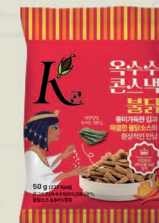
CLEOPATRA SALT Corn snack Buldak 50g

Cleopatra Salt Products is made with seaweed from clean Wando seasoned only with Cleopatra salt, so it contains no artificial sweeteners, giving us healthy and rich flavors.