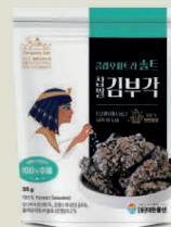
CLEOPATRA SALT Glutinous rice seaweed chips 35g