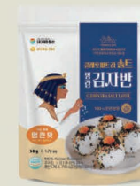
CLEOPATRA SALT Pollack roe seaweed meal 50g