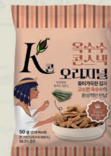
CLEOPATRA SALT Corn snack Original 50g