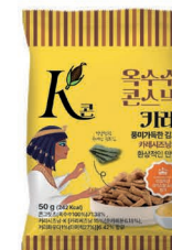
CLEOPATRA SALT Corn snack Curry 50g