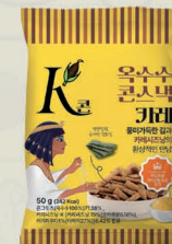
CLEOPATRA SALT Corn snack Curry 50g